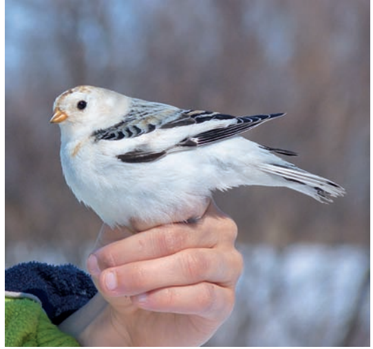
Plate 3. Male Snow Bunting Plectrophenax nivalis caught and ringed on 30 March 2013.