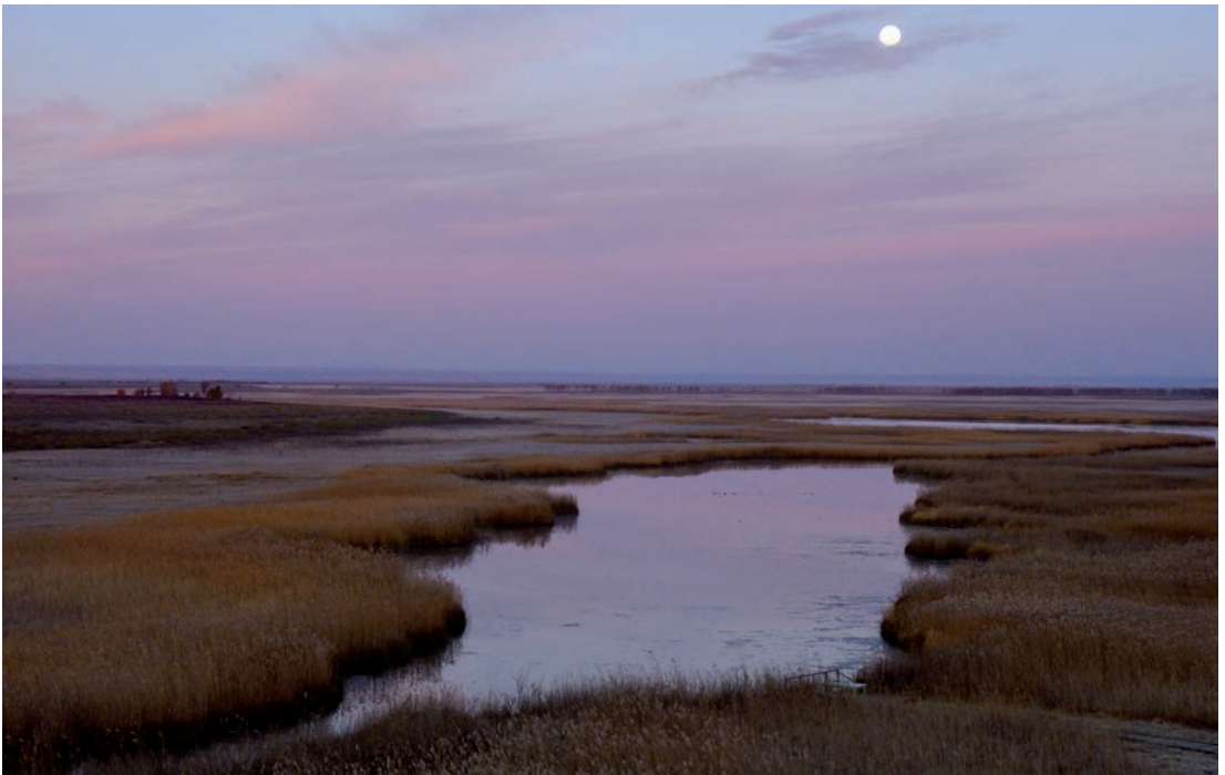
Plate 1. Muriovka Park at dusk, 1 October 2012.

2011 to date over 9,000 birds of 100 species have been mist-netted and ringed, and there have been more than 2,000 re-traps (Heim et al. 2012, Heim et al. in prep.). The most numerous species ringed have been Black-faced Bunting Emberiza spodocephala (881), Long-tailed Tit Aegithalos caudatus (620), Pallas's Reed Bunting Emberiza pallasi (603), Little Bunting Emberiza pusilla (582), Yellow-browed Warbler Phylloscopus inornatus (558), Tree Sparrow Passer montanus (542), Long-tailed Rosefinch Uragus sibiricus (491), Siberian Rubythroat Luscinia calliope (475), Dusky Warbler Phylloscopus fuscatus (426) and Rustic Bunting Emberiza rustica (417). We have collected data on phenology, biometrics, age and sex as well as habitat use; this has never been done before in the Amur region in a standardised way. Some species were recorded for the first time in the area, including Spotted Bush Warbler Bradypterus thoracicus and Asian Stubtail Urosphena squameiceps . Through our work, we confirmed the importance of the park for a variety of bird species