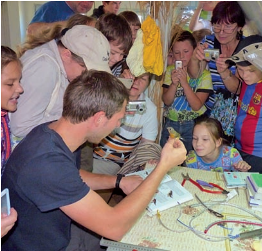
Plate 5. Environmental education is an important part of the Amur Bird Project, 16 September 2012.

During the forthcoming 2013 breeding season, we will collect data on status, abundance and potential threats to the breeding birds of the area, focusing on target species including Baer's Pochard Aythya baeri , Band-bellied Crake Porzana paykullii , Menzbier's Pipit Anthus (gustavi) menzbieri , Manchurian Reed Warbler Acrocephalus tangorum and Yellow-breasted Bunting Emberiza aureola as well as the storks and cranes. Furthermore, we plan to search for Streaked Reed Warbler Acrocephalus sorgophilus —a singing male was observed at Muraviovka Park in 2004 (F. Pekus in litt. ), which is the only known observation from this possible breeding area of this Vulnerable species (Kennerley & Pearson 2010, BirdLife International 2013). This part of the project is supported by a grant from the Oriental Bird Club. The collected data will be used to evaluate the success of the park and to create conservation strategies.