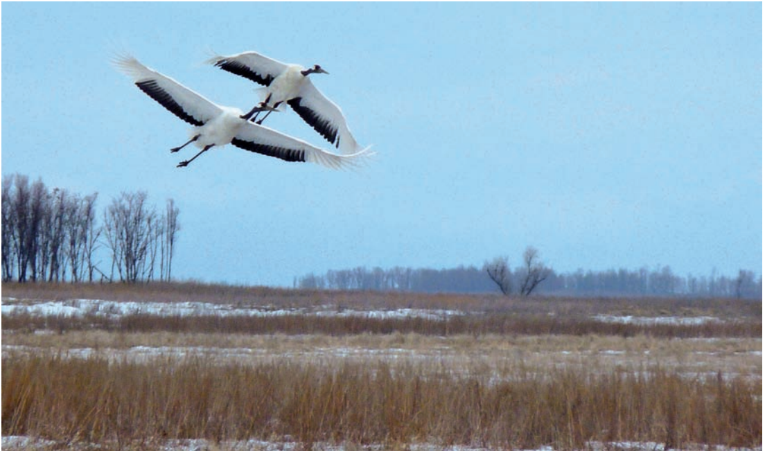
Plate 4. Red-crowned Cranes Grus japonensis are breeding birds in Muraviovka Park, 13 April 2013.

as a safe roosting site. Many birds stay several days or even weeks to refuel, before continuing their journey over thousands of kilometres to their wintering grounds in South-East Asia or India.