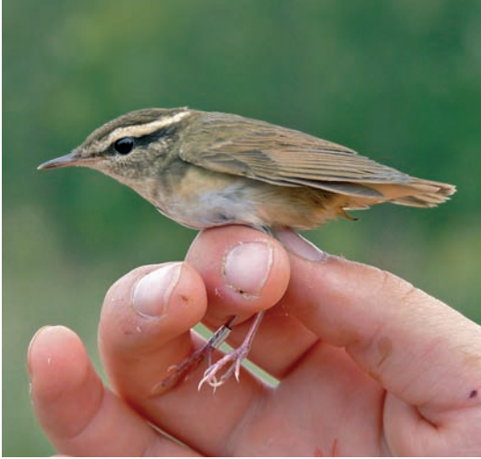
Plate 2. Asian Stubtail Urosphena squameiceps caught and ringed on 9 September 2012. This was a first record for the region.