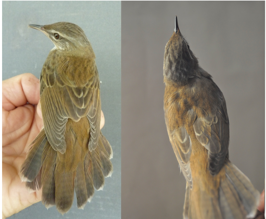
FIGURE 2 Presumed “Magadan grasshopper-warbler” trapped on northward passage in Thailand on May 15, 2011 (left), and a grasshopper-warbler from the breeding area in Magadan, Russia on June 18, 2014 (right). Both individuals exhibit similar identification features: obscure dorsal streaking, including on the upper-tail coverts, and unstreaked rump.

around the Thai Gulf during the months October–April, no others that conformed to the appearance of the Magadan birds were noted.